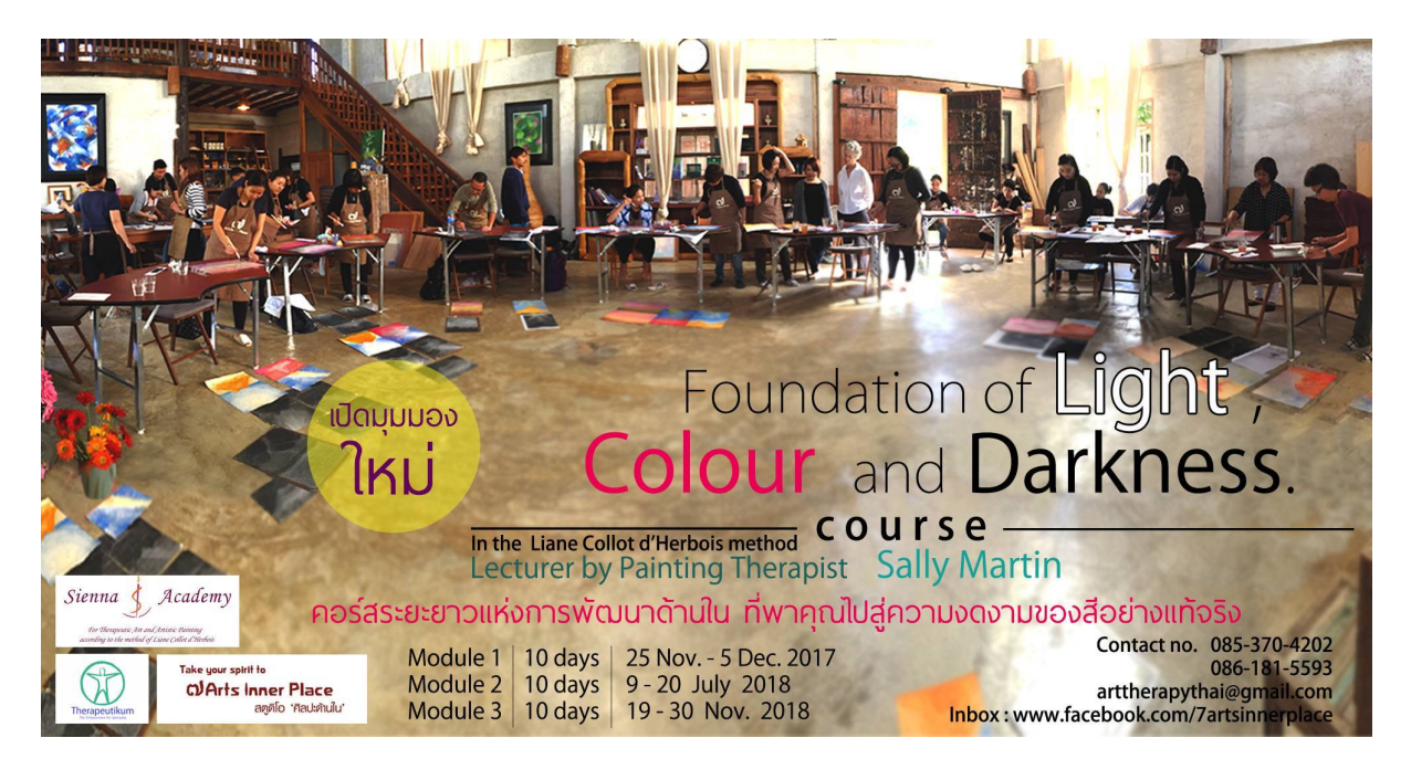
Light, Colour and Darkness Foundation Course

Venue: 7 Arts Healing Place, Chiang Dao, Thailand